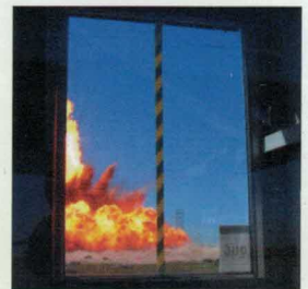
A category C blast load, 4psi 30psi/ms is detonated.

Madico's SafetyShield films have been extensively tested by independent testing facilities and meet Safety Glazing criteria as defined by the U.S. Consumer Product Safety Council (CPSC) and Underwriters Laboratories. Throughout our history, hundreds of windows protected by various Madico SafetyShield solutions have been subjected to both high explosive charges as well as shock tube blast mitigations to meet or surpass GSA and ISO blast criteria. Where most manufacturers test for minimum code requirements, Madico's films have always met or exceeded the requirements of more U.S. and international standards for safety and security than any of the competition.