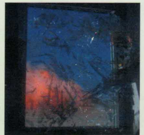
Shock wave breaking untreated window. Glass fragments are blown into the building creating a deadly hazard.