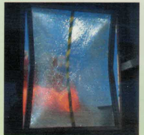
Shock wave hitting treated window with SafetyShield 800 and four-sided FrameGard attachment system. Performs to GSA conditions 2.